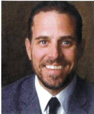
R. Hunter Biden